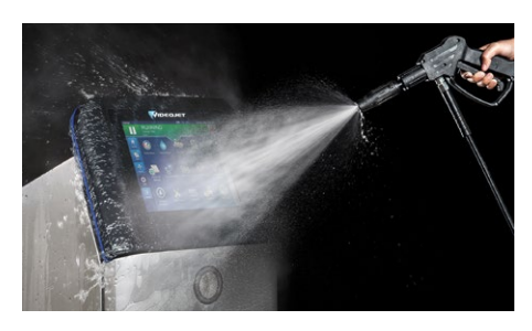
Videojet 1860 CIJ printer